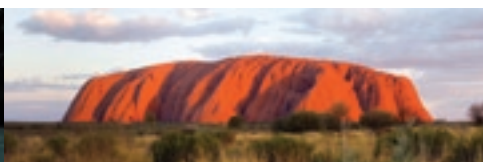
Uluru / Ayers Rock